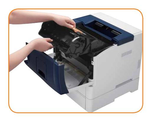
Easy maintenance. Easy access, front loading long life consumables means changing consumables is simple, and is required less often.